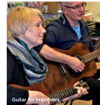
Guitar for Improvers

A course for those who have some experience and prior knowledge of chord shapes, strumming and picking patterns (on either ukulele or guitar).