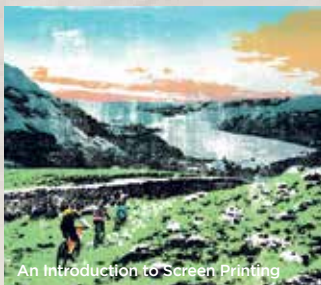
An Introduction to Screen Printing

Make felt in all its forms from vessels and bowls to 'Nuno' and needle felting. You will have the opportunity to try a broad range of techniques and develop your skills.