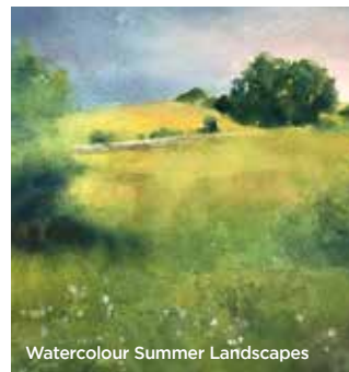
Watercolour Summer Landscapes

Develop your paint handling techniques and confidence to mix colours with a focus on springtime and summer colour in the landscape.