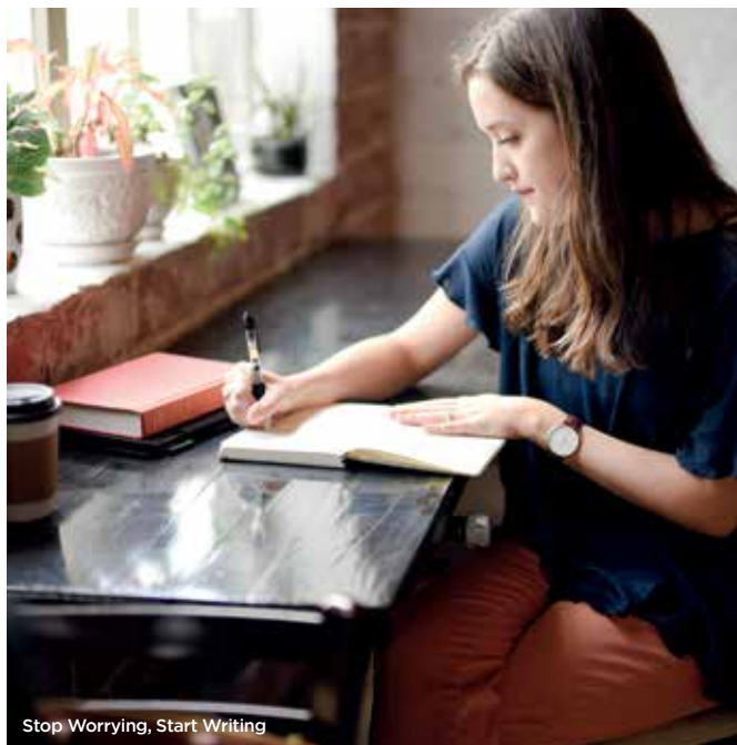
Stop Worrying, Start Writing