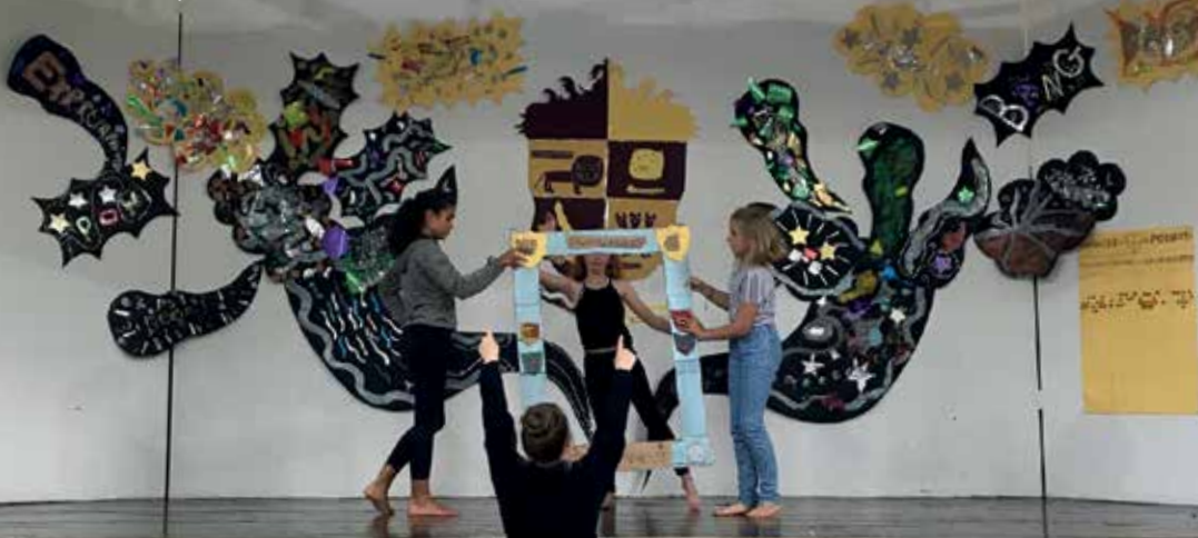
Summer Arts Camp

Bring your favourite stories and characters alive in this 'Dahlicious' week of ingenious invention, creative dance, mischievous drama and ridiculous rhymes.