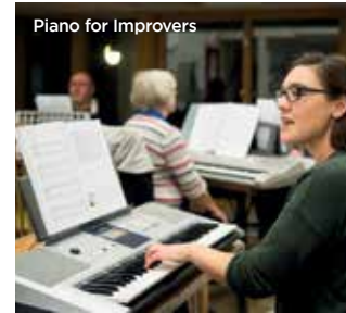
Piano for Improvers

If you are young and serious about theatre, committed to productions and developing skills and techniques, whilst still having a lot of fun, this group will help you be the best that you can be.