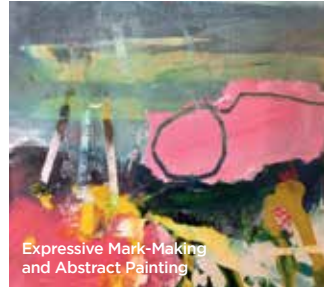
Expressive Mark-Making and Abstract Painting

Fun and lively class where you can develop your skills in art, craft and design.