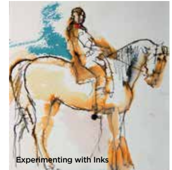
Experimenting with Inks

Learn different techniques on how to create waves, water, paint, rocks and beaches with local artist Thuline de Cock.