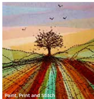
Paint, Print and Stitch

Learn how to create unique pieces of textile art, using fabric paint, print techniques as well as machine and hand embroidery.