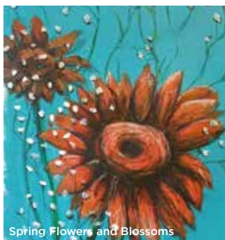
Spring Flowers and Blossoms