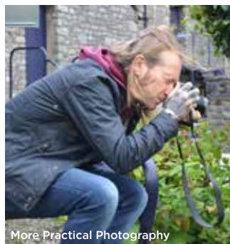
More Practical Photography

This one day workshop will take you through a complete digital workflow from the basic file created in the camera through to the final pigment print. This is an intermediate level course for individuals ready to take forward their skills in the digital workflow arena.