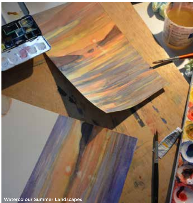
Watercolour Summer Landscapes

Exploit the beautiful properties of watercolour, using big washes and brushes to build layers of colour. Develop paint handling techniques and confidence to mix colours with a focus on springtime and summer colour in the landscape.