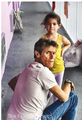
The Florida Project