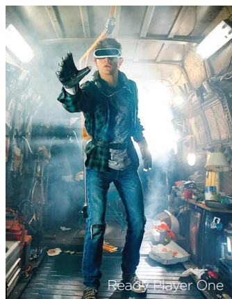
Ready Player One