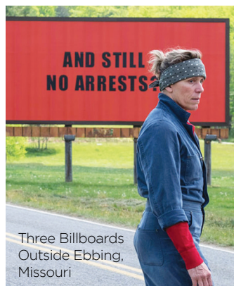
Three Billboards Outside Ebbing, Missouri