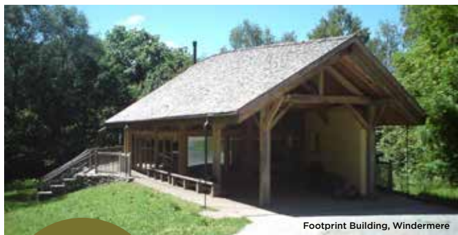
Footprint Building, Windermere

CREATIVE LEARNING IN THE HEART OF THE LAKE DISTRICT