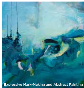
Expressive Mark-Making and Abstract Painting