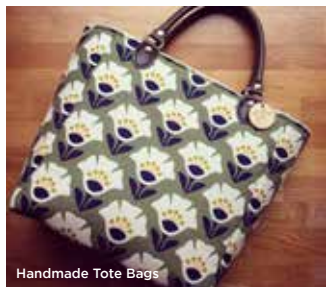
Handmade Tote Bags

Transform your favourite fabrics into a super-stylish and professional-looking tote bag with Emma Redfern of Hole House bags.