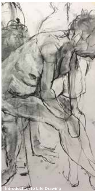
Introduction to Life Drawing

An opportunity for those with some experience to develop their drawing and painting skills directly from a life model.