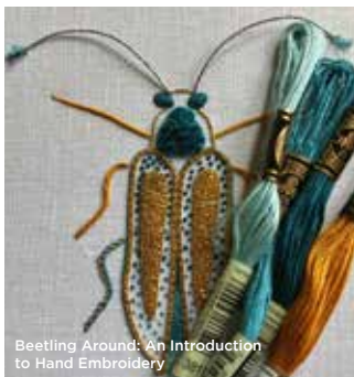
Beetling Around: An Introduction to Hand Embroidery

Both embroidery courses include all materials.