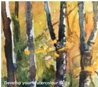
Develop your Watercolour Skills

Develop your watercolour skills and gain confidence exploring techniques such as glazing and creating lights and whites. With a focus on colour theory, learn how to mix colour effectively to create the muted colours for winter landscapes, or shadows in still life.