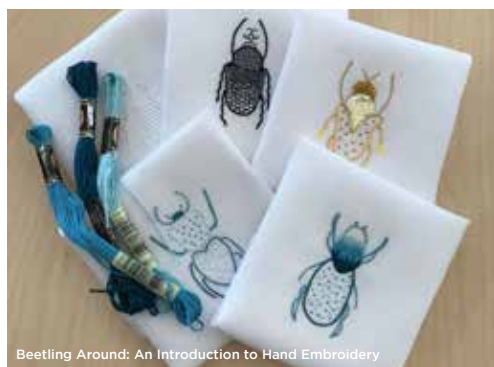
Beetling Around: An Introduction to Hand Embroidery

We are now offering concessions of up to 20% off the full price on selected weekly courses for those in receipt of certain benefits. Please see website for eligibility or phone 01539 722833 for more information.